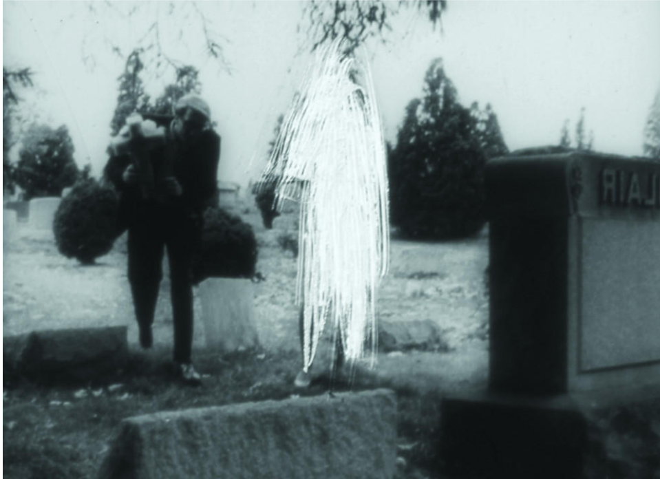
Camille Henrot, Dying Living Woman

Images, ideas, dreams and life become one.