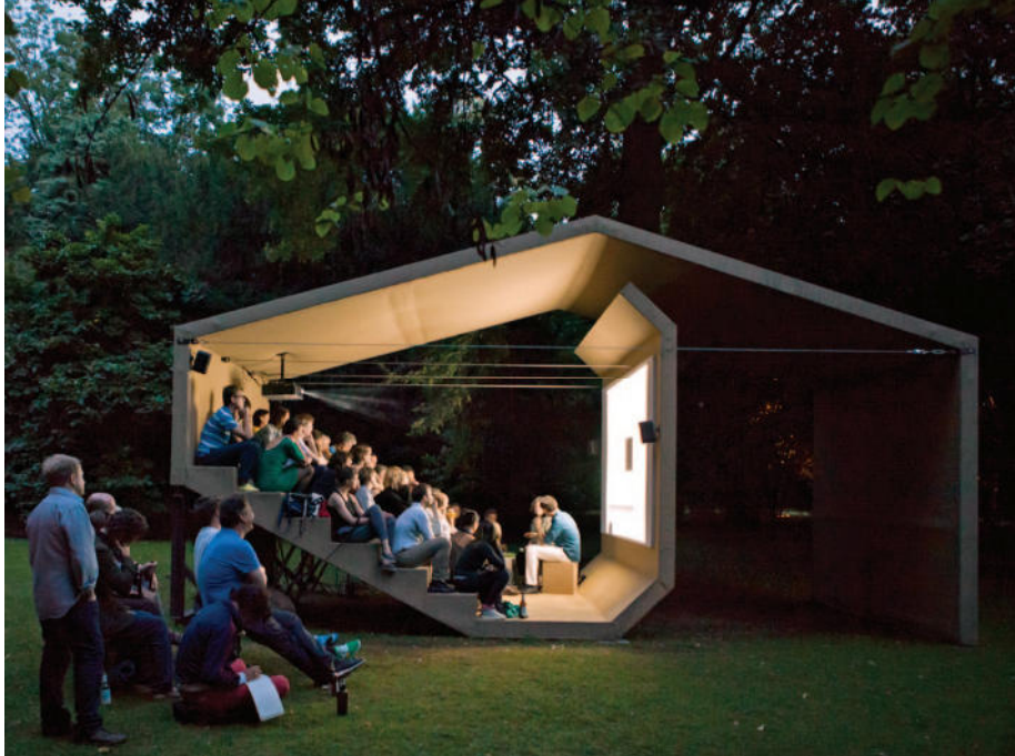
Cinema Pavilion, © Design Erika Hock