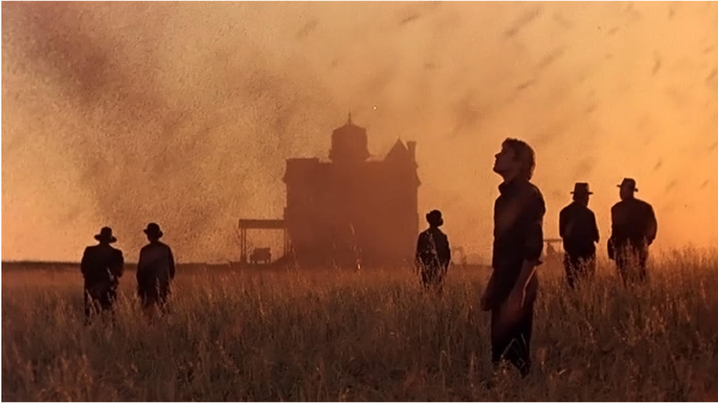
Pavillon: Days of Heaven , Terrence Malick