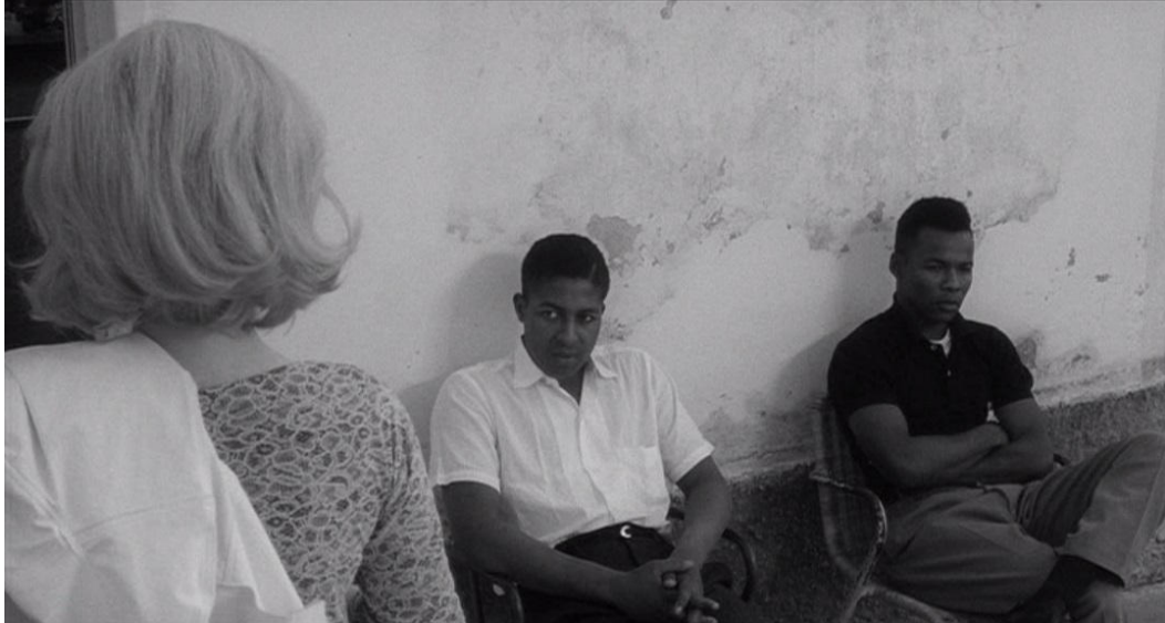
Pavillon: L'Eclisse , Michelangelo Antonioni