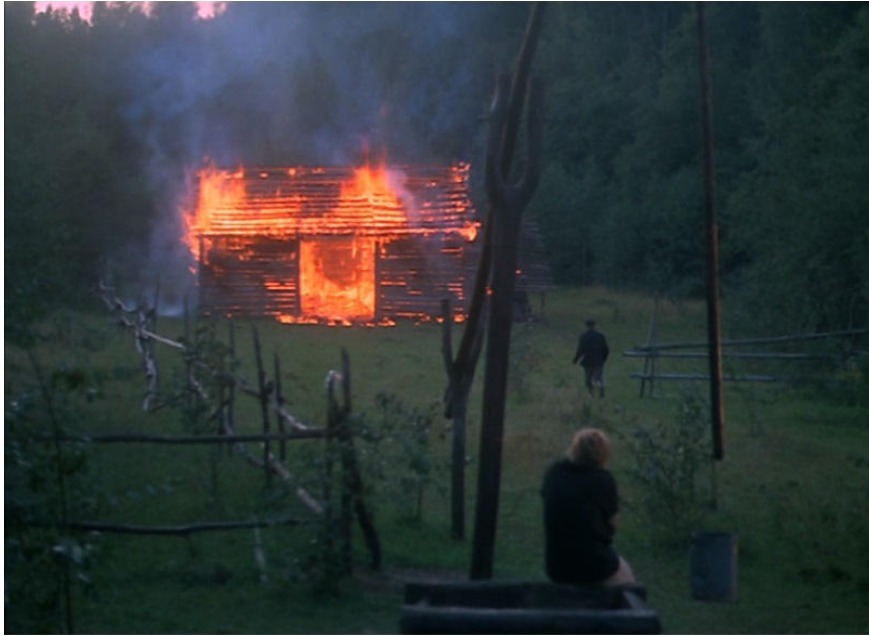
Pavillon: The Mirror , Andrei Tarkovsky