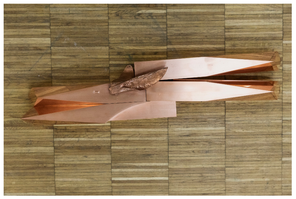
Lucy Skaer, La Chasse, 2017, copper, courtesy of the artist